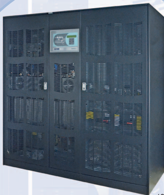
B9600FXS 400 to 800 kVA Three phase On-line double conversion Full IGBT technology Paralleling up to 4.8 MVA